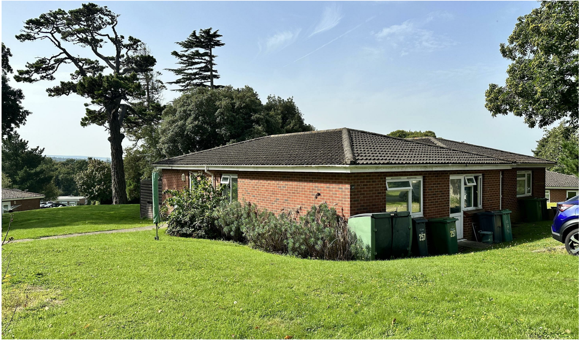
257 Gurnard Pines, Gurnard £125,000